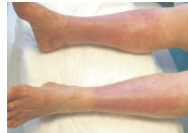
At week three after initiation of treatment, 100% resolution of venous dermatitis