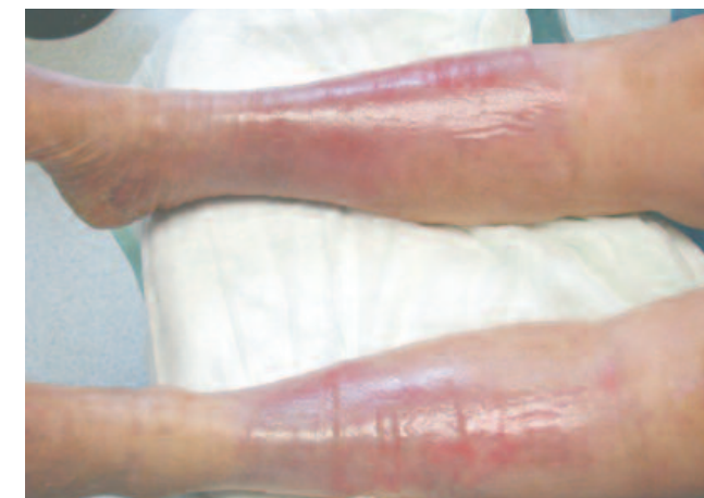
At week two after initiation of treatment