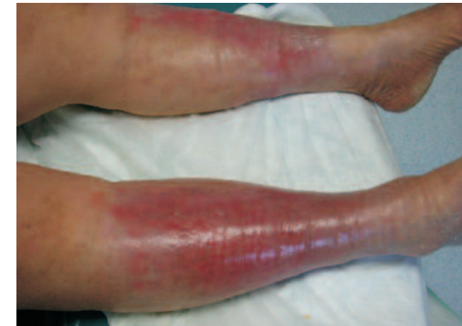
At week one after initiation of treatment

Within one week, a dramatic improvement in the appearance of his skin and a noticeable decrease in the degree of erythema to the lower extremities was assessed. The patient expressed relief from his itching. The venous dermatitis was 100% resolved and the skin was clear within three weeks.